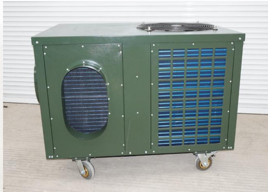
air conditioner for tent