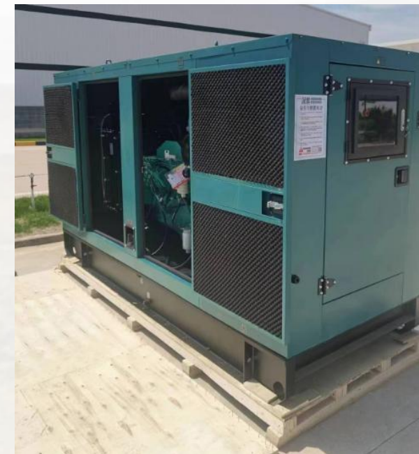
Mobile generator for tent