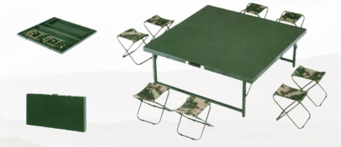
camping desk and chair