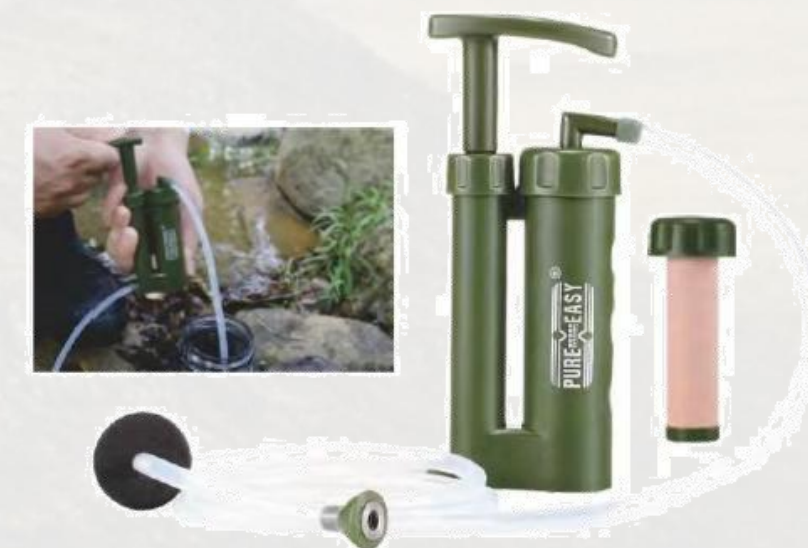
soldier water filter